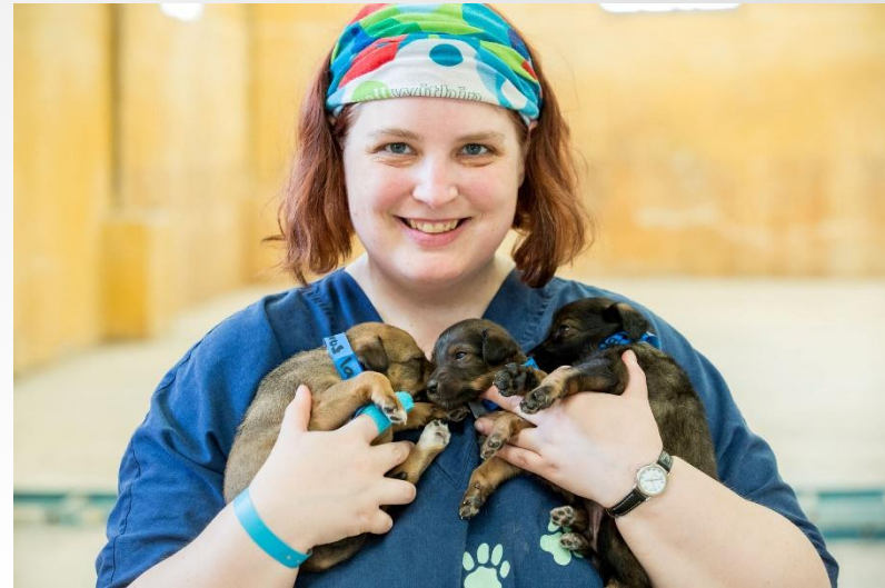
Small animal RVT 2007-2015