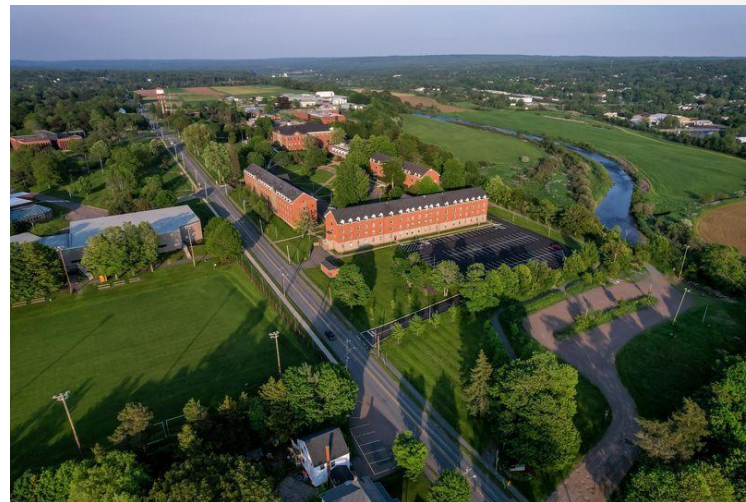
Instructor Dal Ag Campus 2015 -present