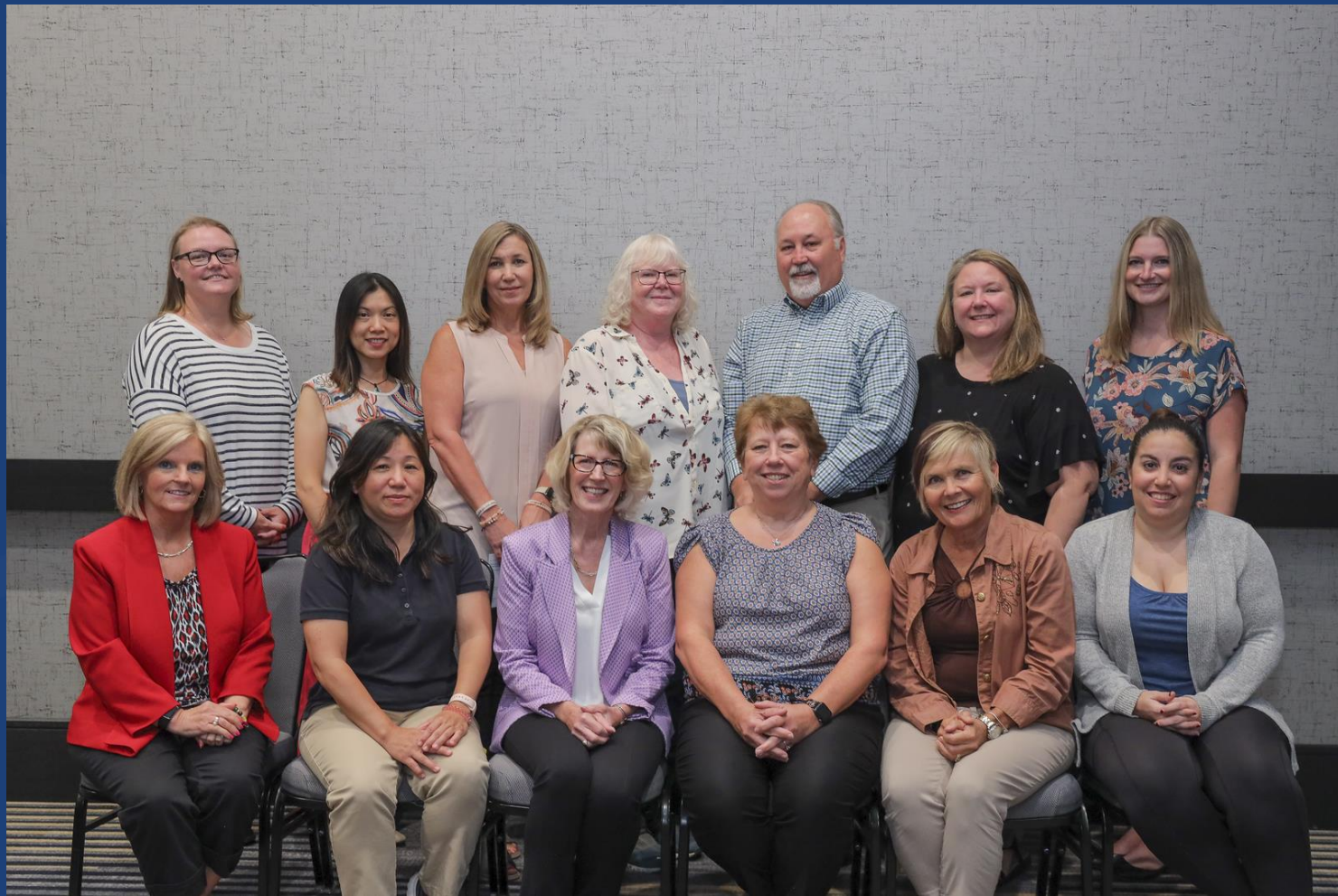
2023 VTNE Committee & AAVSB Staff